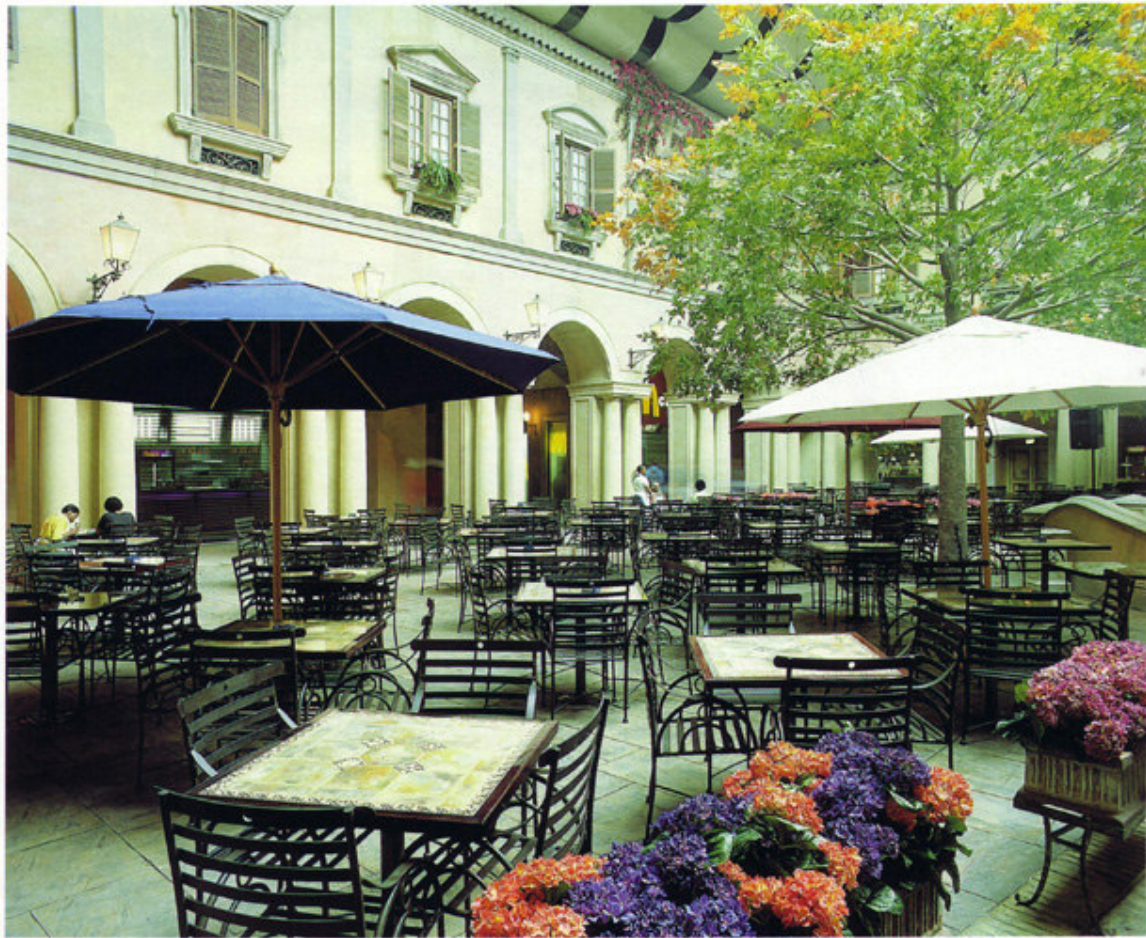
ABOVE: A naturally lit plaza is surrounded by numerous fast-food outlets.